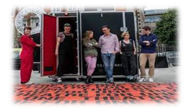
Theatre for One Landmark Productions & Octopus Theatricals