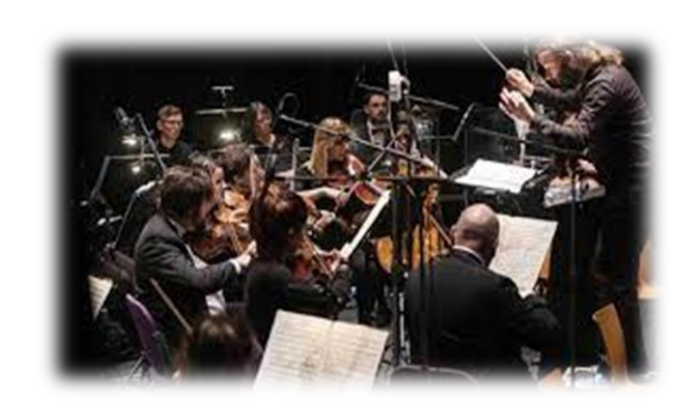
The Cork Proms