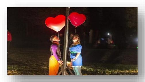
Contact by Corcadorca