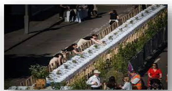
Cork's Long Table