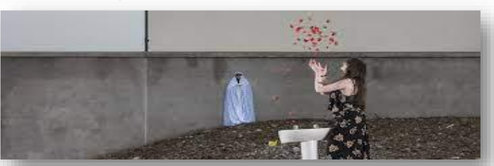
I Can Colour Between the Lines but I Choose Not to